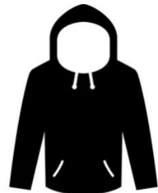
Jacket or Hoodie