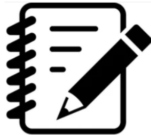
Notebook & Pencils